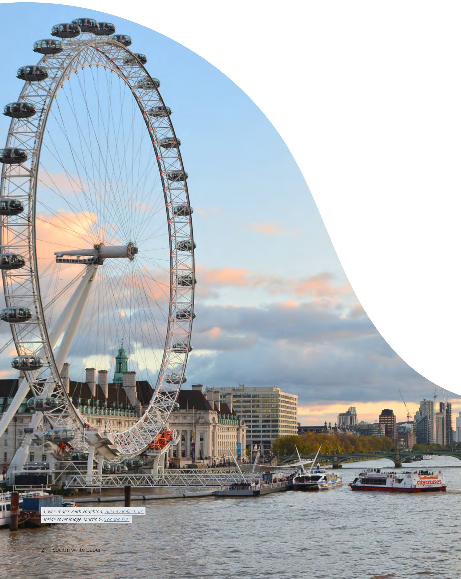
Cover image: Keith Vaughton, 'Big City Reflection' .