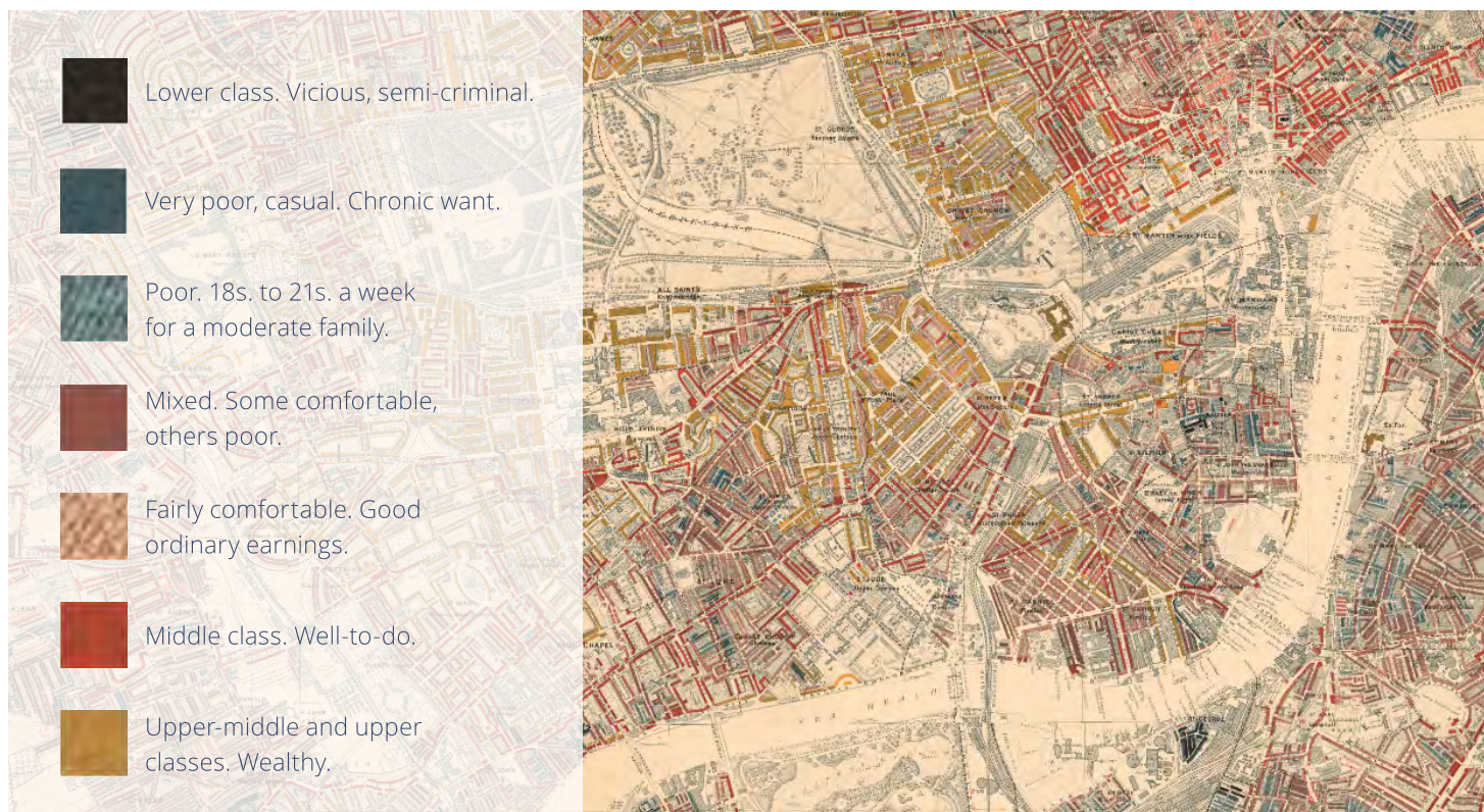
Source: Life and labour in London . Charles Booth's London, available to: https://booth.lse.ac.uk/map/14/-0.1174/51.5064/100/0 . This historic map depicts what was considered demographically notable in 18th century society.

Cécile presented three key problems facing cities: climate change, social and cultural accessibility - affordable housing, and people having a voice in decisions affecting their lives. She cited examples such as the 'liveable and sustainable city' of Singapore, and the focus on people fulfilling activities in Pittsburgh, where development of self-driving cars is centred on mobility and access, not on the technology or modes of transportation. Both of these examples are built on strong foundations - ecosystems - of trust.